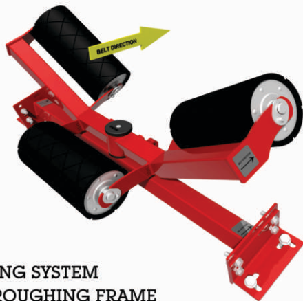
BELT TRACKING SYSTEM 3 / 5 ROLL TROUGHING FRAME